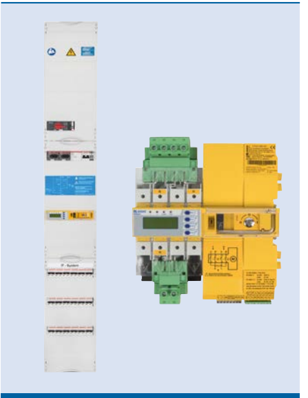
UFA710-2-...-BP-B16 (design example)